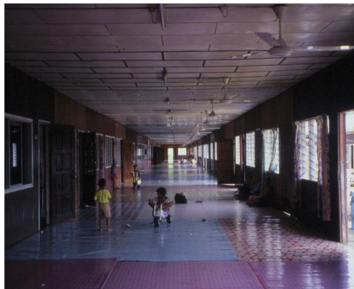
Fig. 2. Rumah Chang interior view in the late 1990s

A single most significant geographical feature that greatly affects people's livelihoods in Rumah Chang is the Niah-Subis Massif. It is a Miocene limestone massif with a summit, Gunong Subis, of 390 meters high. Because of erosion, a gorge is formed in the northeastern corner of the massif and, along with it, a cave system that contains two of the most famous archaeological sites in Sarawak. In addition to abundant 40,000 BP to 2,000 BP remains of human activities, the caves also house millions of Aerodramus maximus , the kind of swift that produces commercially valuable edible birds' nest. Birds' nest and guano collecting thus becomes one of the major sources of cash income for the people of Rumah Chang. The entire Niah-Subis Massif was gazetted in 1975 and became a national park. Tourism has since brought some subsidiary benefit to Rumah Chang people in the forms of chances of vending food and drinks and providing homestays for group visitors and backpackers.