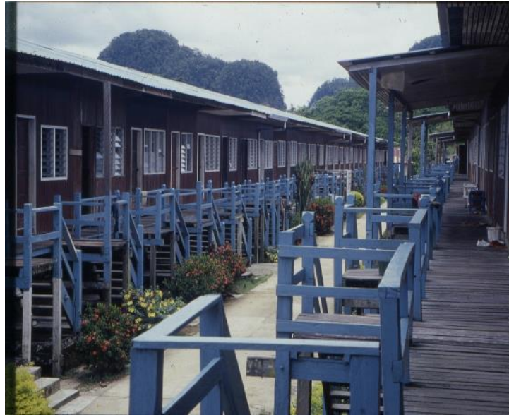
Fig. 1. Rumah Chang exterior view in the early 2000s

A single most significant geographical feature that greatly affects people's livelihoods in Rumah Chang is the Niah-Subis Massif. It is a Miocene limestone massif with a summit, Gunong Subis, of 390 meters high. Because of erosion, a gorge is formed in the northeastern corner of the massif and, along with it, a cave system that contains two of the most famous archaeological sites in Sarawak. In addition to abundant 40,000 BP to 2,000 BP remains of human activities, the caves also house millions of Aerodramus maximus , the kind of swift that produces commercially valuable edible birds' nest. Birds' nest and guano collecting thus becomes one of the major sources of cash income for the people of Rumah Chang. The entire Niah-Subis Massif was gazetted in 1975 and became a national park. Tourism has since brought some subsidiary benefit to Rumah Chang people in the forms of chances of vending food and drinks and providing homestays for group visitors and backpackers.