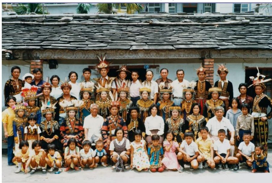
Fig. 3. The family photo of the Ruvaniaio chief in front of their old house

Along with land reform, Taiwan government also launches a series of promotions of forestation and the cultivation of cash crops. As a result, the houses that have more land under their disposal are also the bigger beneficiaries of economic development. Among the three biggest landowners of Parilaiyan, the Dalimalao have moved to another village at the foothill to be closer to medical facilities and entrust the house to a cousin, the head of Kalesngan house. The head of Kalesngan house is a retire policeman, he is both wealthy and, in a sense, well connected. The head of Kauma?an house, also a cousin of the Dalimalao house, speak very good Japanese because of earlier education and which facilitates his communication with local Chinese businessmen, who share a similar background in Japanese education with him. And most significantly, they also choose to invest their wealth in the rebuilding and remodeling of their house, either to revitalize the traditional style slate building, or to build a new concrete house with modern material but carrying the traditional artistic decoration.