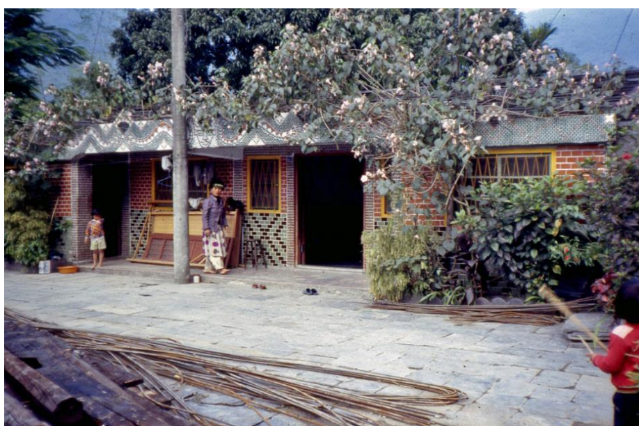
Fig. 4. The chiefly Kaoma?an house is decorated with traditional pattern using mosaic