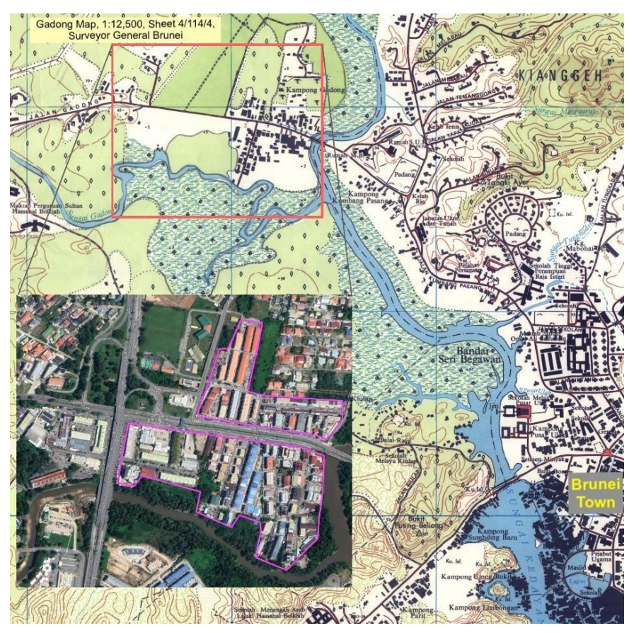
Fig. 1. Menglait Commercial Area embedded in 1972 Map of Gadong, Brunei Darussalam Source: Authors (2022)