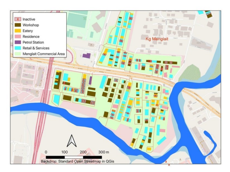
Fig. 2. Spatial Pattern in the Menglait Commercial Area

As for eateries, besides the traditional coffee shops like Jing Chew and Tasanee, which offer low prices compared to cafes and branded fast floods, they provide local fare at low prices. Several new establishments, particularly in Gadong Central during the mid-2010s, cater to the younger generations. They encompass fast food (KFC) and boutique-type eateries with more regional offerings in stylized settings, such as peranakan , Taiwanese, Indonesian, or various fusions to cater to the Yuppies, Millennials, and Hipster consumer group. Other businesses, such as clinics, barber/salons, printing, and insurance, cater similarly to common people. In summary, Menglait is known for automotive services and coffee shops for quick meet-ups among colleagues, business discussions, and catching up among friends. A number of companies have withstood the test of time and have become reference points for the MCA. Their stories will be elaborated on in the next section on tapestry analysis.