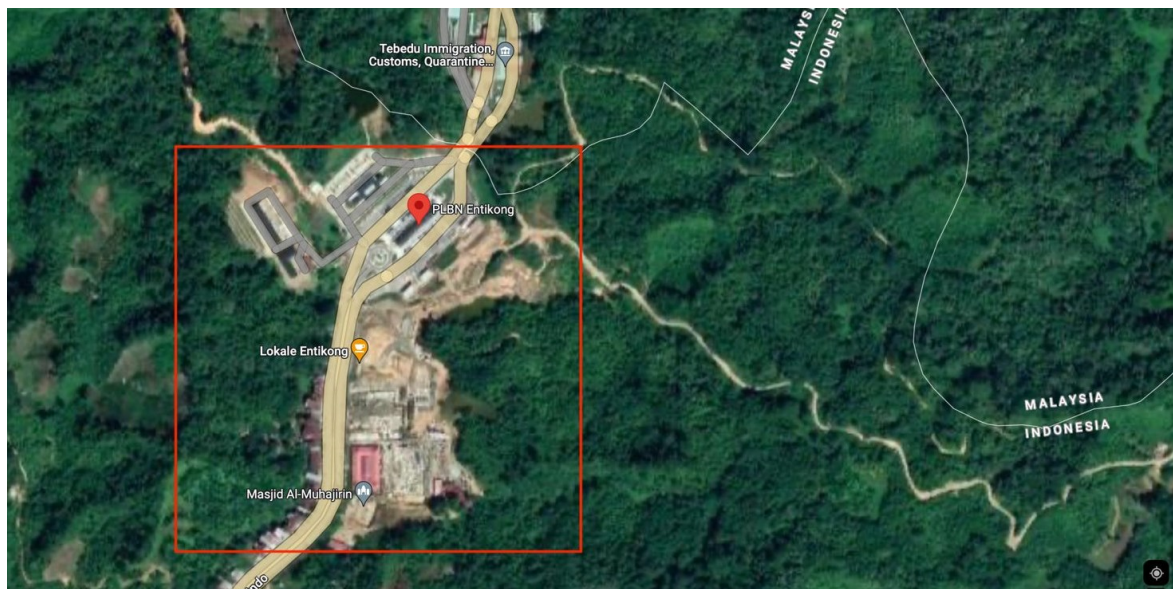
Fig. 1. Border Checkpoint or Pos Lintas Batas Negara (PLBN) Entikong Area

The ambiguity showed up because of a divided definition of border area. As Law Number 43 of 2008 suggested, the border area is the regency and district area located at the border of Indonesian sovereignty. However, with the BNPP establishment, the central government situated the area of the national border post, with a total of 19.493 m 2 , exclusively as their area of authority and bordering themselves with the area managed by the local government (see Fig. 1).