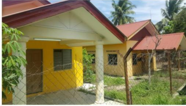
Fig. 4. Two blocks of buildings were prepared that can facilitated around maximum of 50 people only.