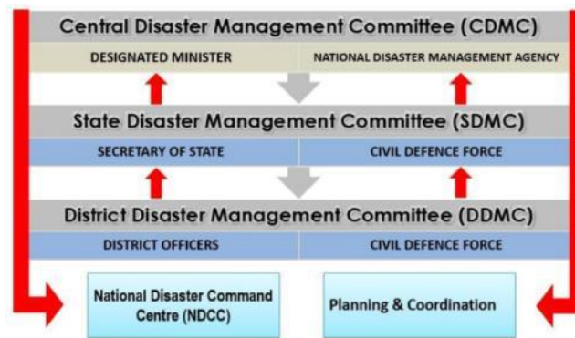
Fig. 1. Disaster management mechanism in Malaysia.

"in the phase of disaster preparedness, it is a tool for planning evacuation routes, designing emergency centers and integrating satellite data with other relevant data in the design of disaster warning systems".