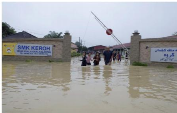
Fig. 7. SMK Keroh was flooded due to the overflow of Sungai Nal in Kampung Keroh in 2014