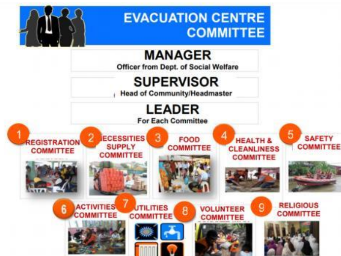
Fig. 2. The organisation chart of evacuation centre in Malaysia

According to Department of Social Welfare Malaysia (2019), every evacuation centre in Malaysia was managed by a group of local people appointed by District officer. Each evacuation centre was led by one manager who is an officer from Department of Social Welfare District office. Officer can manage more than one evacuation centre.