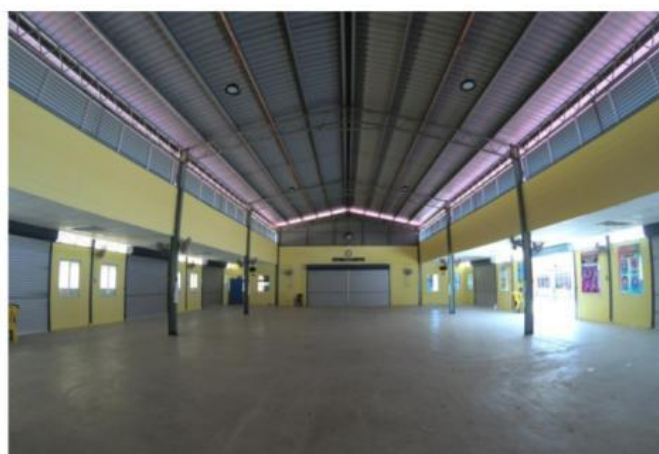
Fig. 8. Hall that used to accommodate flood victims.