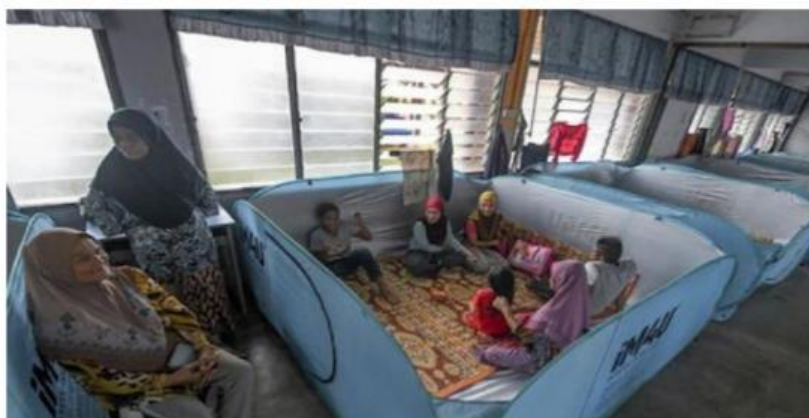
Fig. 9. Tents were provided for each family as sleeping area

Sekolah Menengah Kebangsaan Agama (SMKA) Lati located at Pasir Mas, Kelantan was gazetted as an evacuation centre to be used by the flood victims by Department of Social Welfare. The village involved are the resident from Kg. 61 Banggol Jering, Kg. Banggol Manak, Kg Kepas Apam, Kg Lati, Pondok Lati, Kg Serai Lima, Taman Alia and Taman Sri Mas. The facilities provided are hall, mosque, multipurpose classroom, canteen as dining area and toilet at each block (Figure 8).