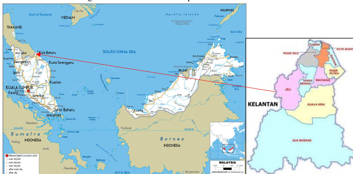
Fig. 3. Map of Kelantan in Malaysia.

The case studies were in Kelantan, at the most affected area of the flood. The areas are the most affected area with the largest evacuees due to an unexpected rise of flood in 2014.