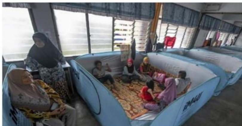
Fig. 9. Tents Were Provided for Each Family As Sleeping Area

Sekolah Menengah Kebangsaan Agama (SMKA) Lati located at Pasir Mas, Kelantan was gazetted as an evacuation centre to be used by the flood victims by Department of Social Welfare. The village involved are the resident from Kg. 61 Banggol Jering, Kg. Banggol Manak, Kg. Kepas Apam, Kg. Lati, Pondok Lati, Kg. Serai Lima, Taman Alia and Taman Sri Mas. The facilities provided are hall, mosque, multipurpose classroom, canteen as dining area and toilet at each block (Fig. 9).