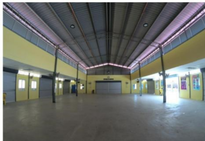
Fig. 8. Hall That Used to Accommodate Flood Victims

Sekolah Menengah Kebangsaan Agama (SMKA) Lati located at Pasir Mas, Kelantan was gazetted as an evacuation centre to be used by the flood victims by Department of Social Welfare. The village involved are the resident from Kg. 61 Banggol Jering, Kg. Banggol Manak, Kg. Kepas Apam, Kg. Lati, Pondok Lati, Kg. Serai Lima, Taman Alia and Taman Sri Mas. The facilities provided are hall, mosque, multipurpose classroom, canteen as dining area and toilet at each block (Fig. 9).