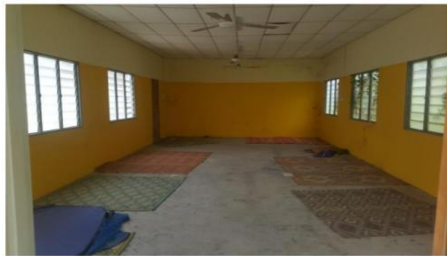
Fig. 5. Hall to accommodate flood victims.