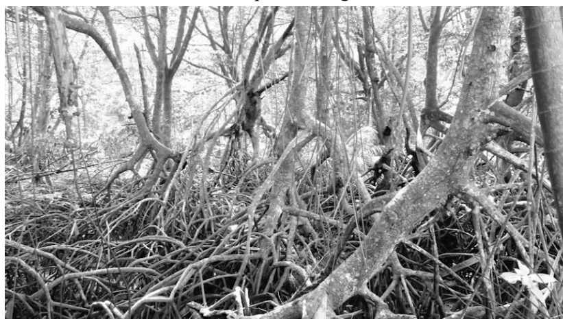
Fig. 4. Root Structure of the Rhizophora Mangrove

Another design solution would be to link the support structure by clustering. As mangroves grow and develop, the roots of individual trees intermesh to form a larger complex that support and enhance the stability of the whole cluster. This would also foster sedimentation, resulting over time in building land and raising the mangrove above the tidal level, away from erosive currents. Presently, individual KA houses are only tenuously connected via their links to the walkways that straddle the settlement complex. Drawing from the development strategy of mangroves, the support structures of individual houses could be interconnected by intermeshing them deliberately to strengthen the stability of the cluster rather than keep individual houses separated. This could be done by combining the structure with others to integrate multiple functions within the same structure, for example, sewage and trash management, and or food production. Natural structures are always multifunctional in design. Fig. 4 shows the dense network structure of the Rhizophora mangroves.