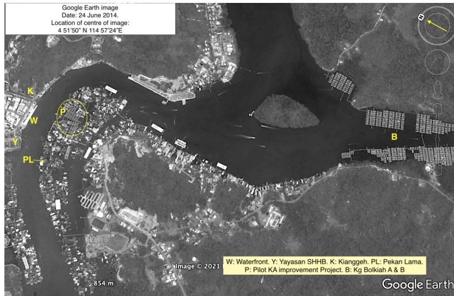
Fig.3. Organic vs. Planned Patterns.

500-600 years. As a living organism, the mangrove tree will add more stilts and increase the size of older stilts to support the above-ground structure as it grows. In KA, house have also increased in size and considerably in weight due to modernisation, coupled with affluence brought about by oil wealth. Details of this transformation during the 20 th Century are provided by LeBlanc (2017). The increase in house size is supported by a concomitant increase in the number of stilts, but of the same design and dimensions, following engineering design standard and practice.