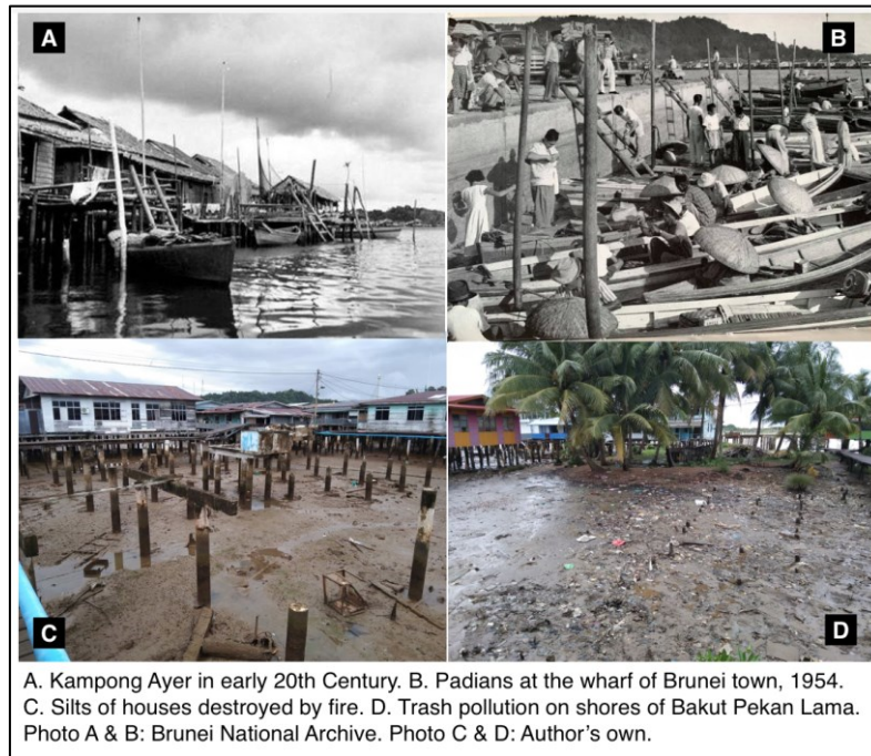
Fig. 2. Glimpses of Kampong Ayer