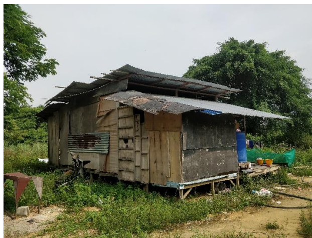
Fig.4. Exterior view of the on-site temporary workers' accommodation with poor condition

On-site observation was conducted at one of the construction project to evaluate the common type of temporary construction workers' accommodation provided by the contractor. In overview, the quality of temporary workers' accommodation provided by the contractor at one of construction site is poor compared to the one provided by the government agencies. The differences identified based on the location, lacking of facilities, materials used, the condition of the accommodation and cleanliness of the bathroom and sanitary facilities. This shows that the contractor take very lightly on the welfare and living condition of the foreign construction workers.