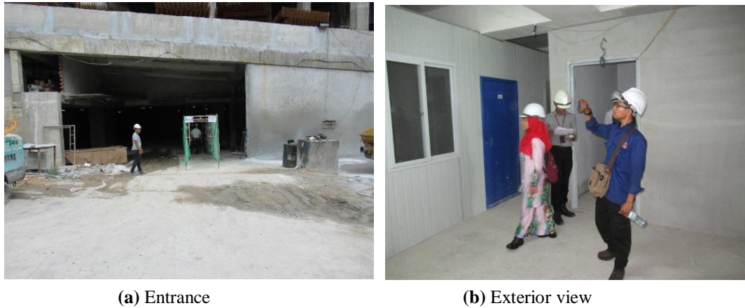
Fig. 3 (a) & (b): The entrance and exterior view of the bedroom for the construction workers

The second case study is a pilot project initiated by KLCH located inside a high-rise construction project at Bangsar South, Selangor. According to the Garis Panduan Asrama Sementara Pekerja Dalam Bangunan Bertingkat Di Tapak Binaan , the temporary construction workers' accommodation allocate at the ground floor until level two.