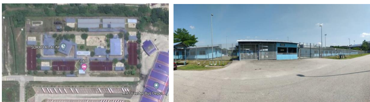
(a) Master Plan

The first case study is a pilot project initiated by CIDB under the supervision of Construction Labour Exchange Centre Berhad (CLAB) which is Centralised Labour Quarters (CLQ). The building is located at Jalan Sungai Buloh, Subang, Shah Alam, Selangor. CLQ is located outside of the construction site and rented to employer that could not afford to provide and accommodation for their workers.